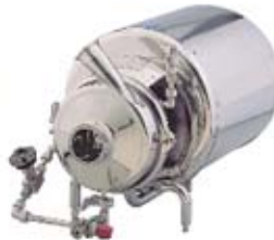
Highest Hygienic Centrifugal Pump "PROLAC SWFI"