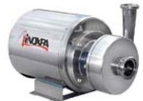
Centrifugal Pump "HYGINOX SH"

Graco's FDA-compliant, high sanitation and transfer pumps, plus our drum and bin unloaders are used in a variety of sanitary applications. Our sanitary product line is broken down into FDA, USDA and 3-A classifications.