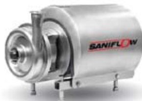
Sanitary Centrifugal Pump