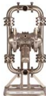
Saniforce 3A Double-Diaphragm Pump