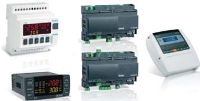
temperature controller, timer & counter, sensor