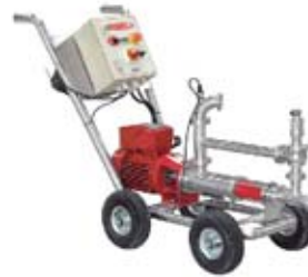
Progressive Cavity Pump Sanitary "KIBER"