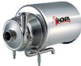
Sanitary Centrifugal Pump "PROLAC"