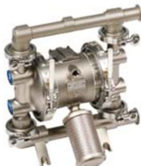
Sanitary Air-Operated Double Diaphragm Pump