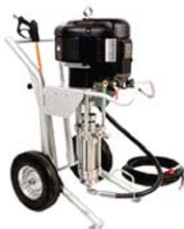
Cleaning Package "HYDRA-CLEAN"