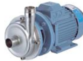
Centrifugal Pump "ESTAMPINOX EFL"