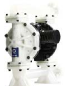
Industrial Diaphragm Pump