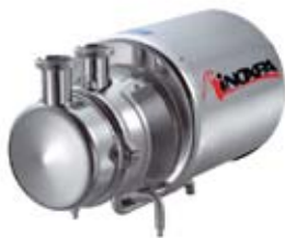
Self-Priming Pump "ASPIR"