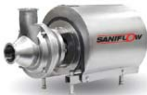
Sanitary Liquid-Ring Pump