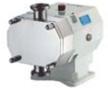
Lobe Pump "SLR"