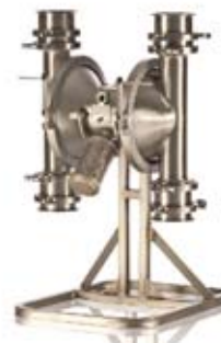
Saniforce Meat & Poultry Double Diaphragm Pump